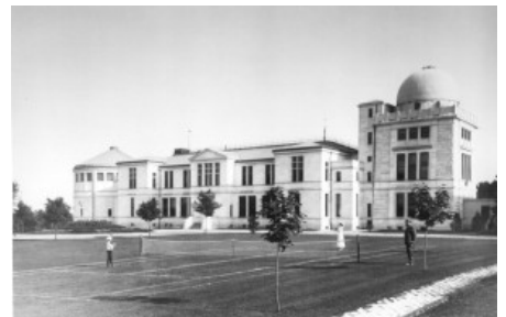
United States Naval Observatory — Washington, DC. Exterior View of the James Melville Gillis building, 1903. Note the people playing tennis on the front lawn.